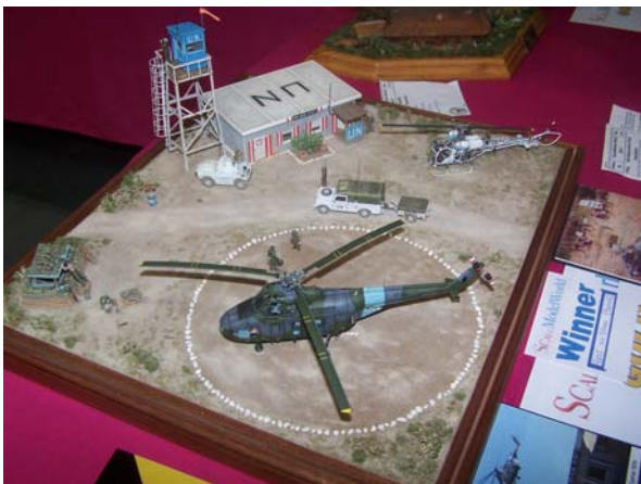
Left—The Best in Show Trophy went to this well presented 1/72 Westland Whirlwind and Sioux helicopter diorama