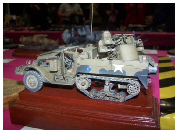
Right— 1/35 scale Polish M16 Quad .50 Gun Carriage in European "mouse ear" camouflage