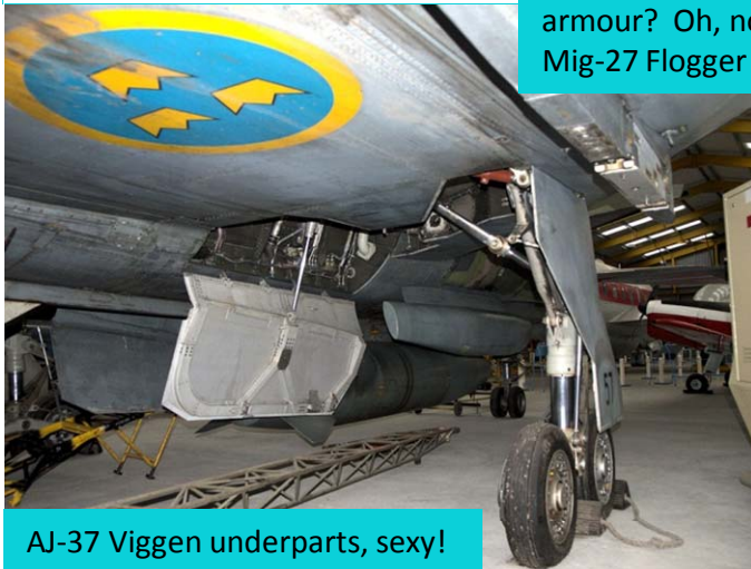
AJ-37 Viggen underparts, sexy!