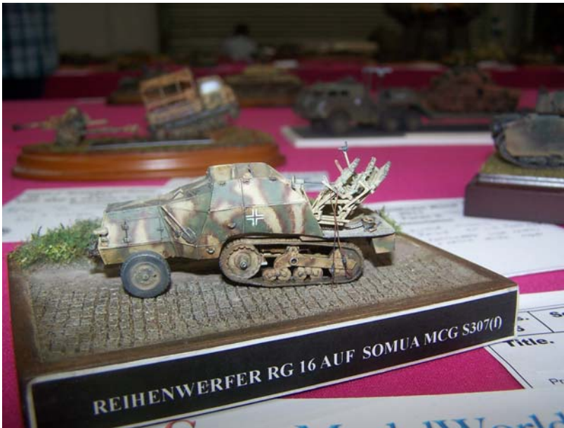
Left—a 1/35 scale something I can't pronounce, but you can read the label yourself.