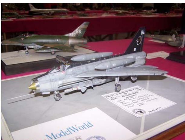
Left—Lothar Wolf's 1/48 Airfix Lightning F.6 in 11 Squadron markings

Visit our website at http://www.ipms-ipswich.org.uk sponsored by