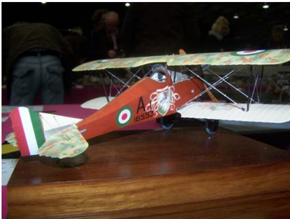
Left— 1/48 scale Italian Ansaldo S.V.A. 5