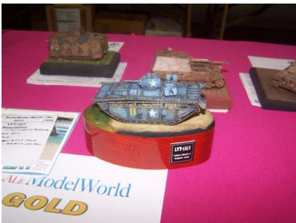
Left—1/72 USMC LVT (A) 1, Yellow Beach 2, Saipan 1944