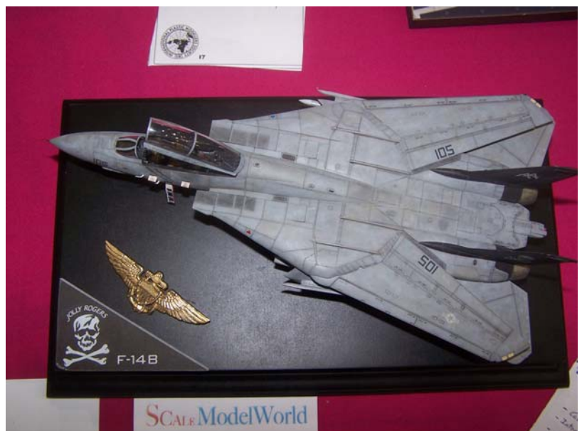
Right—The weathering on this 1/72 F-14 Tomcat was spot on! One of the best 1/72 jets in the competition