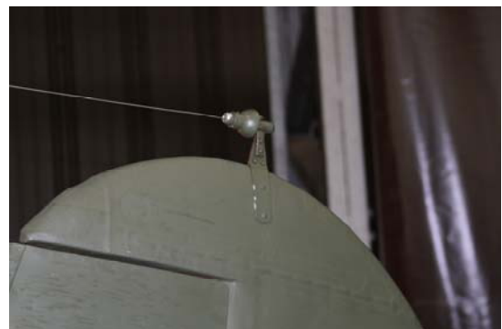
Right photo shows the radio aerial termination on the rudder of a Spitfire Mk 1.