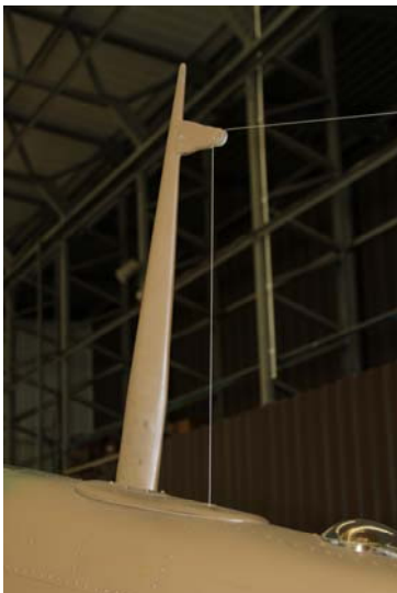
Left photo depicts the antenna mast and base plate for a Spitfire Mk 1. Note the routing of the aerial wire.