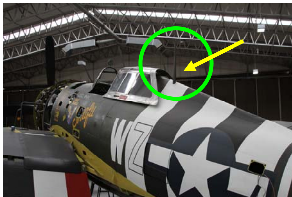
The antenna mast on this P-47G is off-set to the left